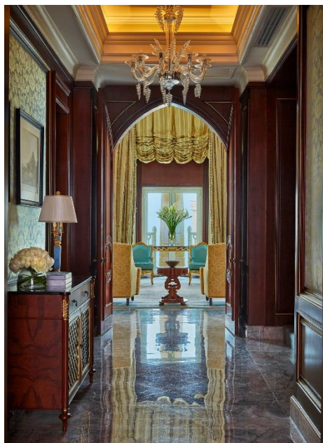
The Royal Suite

The Royal Suite is a two-storey private residence on the Hotel's top floor, comprising a flowing arrangement of meeting, living, dining, catering and sleeping quarters; at the centre is a large double-height living room that opens onto four furnished terraces. Marble and gold décor, chandeliers, atmospheric lighting, bespoke artwork, Turkish rugs and large floral displays enhance the lavish appeal of this palatial accommodation. A private elevator ascends to two king bedrooms with dressing rooms and furnished terraces with panoramic views across the calm, turquoise waters of the Arabian Gulf and the distant curve of the West Bay skyline. The Royal Suite can also be booked as a venue for special events from candlelit cocktail evenings to product launches.