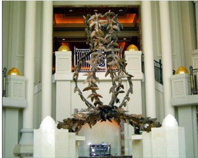
The Doves of Peace, Ali Al Jabiri

One of the most prominent pieces of artwork in the Hotel is The Doves of Peace by Iraqi sculptor Ali Al Jabiri. Located in the soaring triple-height atrium of the Hotel's lower Grand Lobby, the obvious symbolism of the precariously balanced bronze birds, soaring 10ft above the miniature domes of the water feature below, is tempered by the unified beauty of the design and the proliferation of birds depicted.